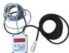
Remote thermostat THK with probe 4150.137